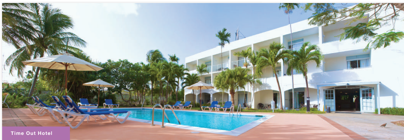
Time Out Hotel