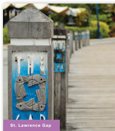
St. Lawrence Gap